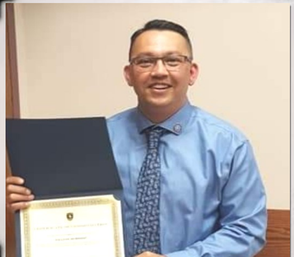
Police Records Bureau

"Sometimes we can only find our true direction when we let the wind of change carry us." - Mimi Novic