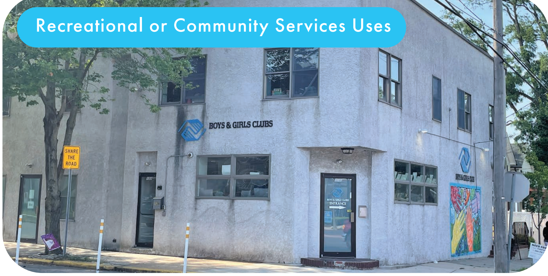
Recreational or Community Services Uses